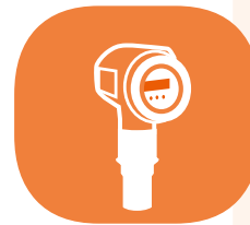
SENSORS AND INSTRUMENTATION